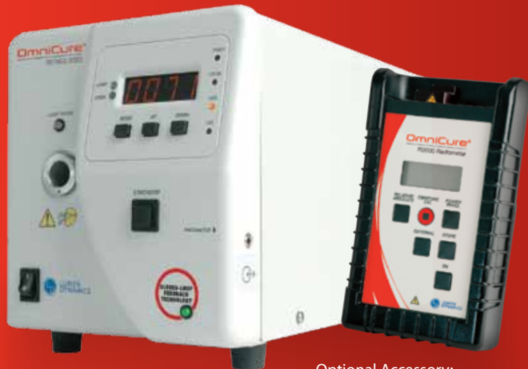
Optional Accessory: OmniCure® R2000 Radiometer

To accommodate the various needs of its' customers, the OmniCure® S2000 is adaptable to four different light guide options. Ideally used with a multi-legged High Power Fiber Light Guide to cure multiple sites with a single light source, Single-Legged, Liquid-Filled and Fiber Light Guides are also available.