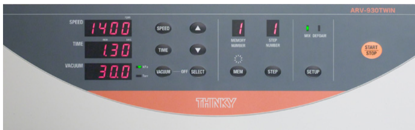
ARV-930TWIN CE Control Panel

9 memories are available. Loading by one key.