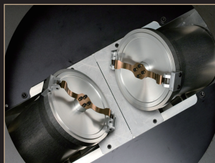
Cup holder vacuum